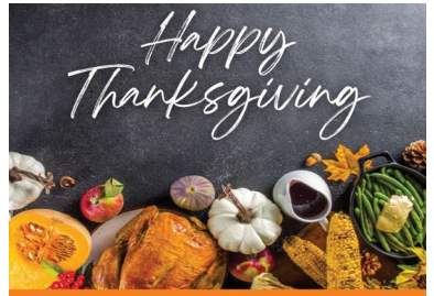
From our table to yours, Mitchell EMC wishes you and yours a Happy Thanksgiving. We're grateful for our members and the opportunity to power your life. Our offices will be closed on November 23 & 24.